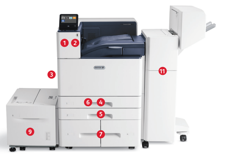
Xerox® VersaLink C8000 Color Printer