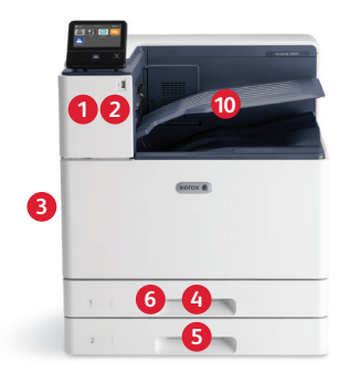
Xerox® VersaLink C8000 and C9000 Default Configuration