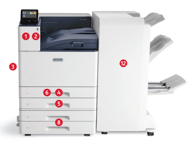
Xerox® VersaLink C9000 Color Printer