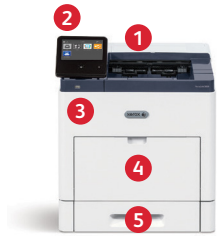
Xerox® VersaLink B600 Printer Print.