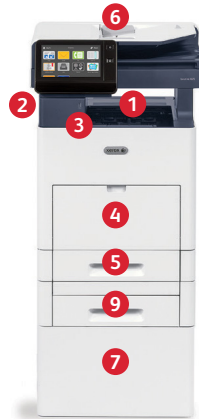
Xerox® VersaLink B605 Multifunction Printer Print. Copy. Scan. Fax. Email.